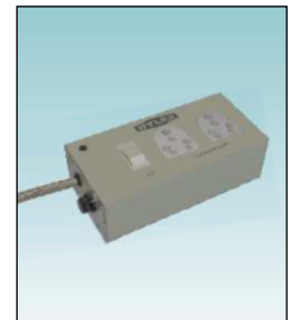
Socket Out Let