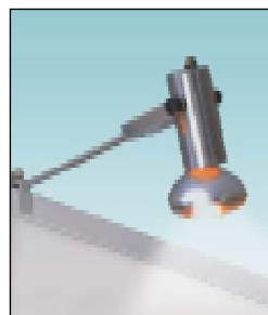
Arm Spot Light