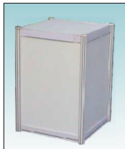
Podium W H D 50cm 70cm 50cm