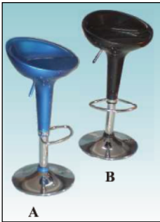
Bar Stool (Adjustable) H - 50cm