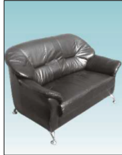
VIP Sofa Double