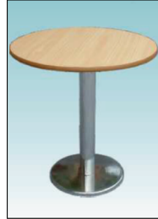
Round Table Dia H 70cm 75cm