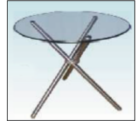
Round Table (Glass top) Dia H 90cm 75cm