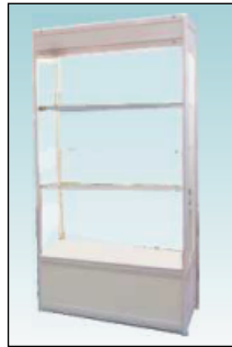
Glass Show Case W H D 100cm 200cm 50cm