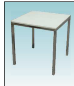
Square Table W H D 70cm 70cm 70cm