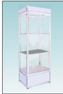
Show Case (Slim) W H D 50cm 200cm 50cm