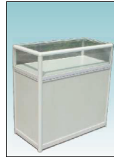
Glass Counter W H D 100cm 100cm 50cm